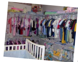
the baby store

Hosting a baby shower is a simple, practical way you can keep our baby store stocked and help new parents. Our store is running low on diapers (sizes NB, 4, 6) and baby equipment. If you'd like to host a shower or donate to the baby store, please call us at 723.3540.