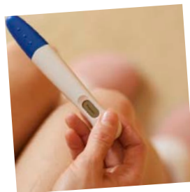
missing something this month?

67% of our clients are between the ages of 15-24. This same age range accounts for half of abortions in the United States.