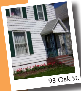
93 Oak St.

Many of you have played a part in these 17 successful years. Last year, Life Choices Center volunteers logged nearly 3,000 hours!