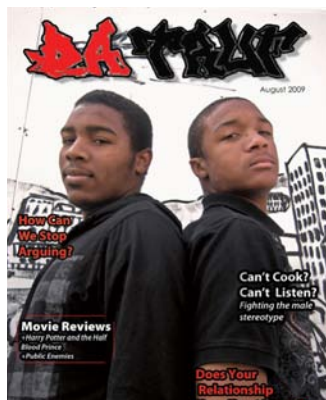
Sneak Peek: DaTruf

Throughout our six weeks together, we had great conversations. One girl interviewed the guys in the group (none of them have their father living in the house) for an article about the effects of growing up without a dad around. No one was more surprised than me to see boys who one moment earlier were laughing and pushing each other around settle down and get serious as they considered the question.