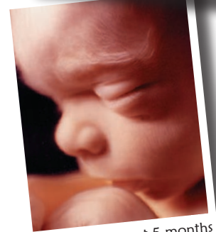
fetus at 5 months